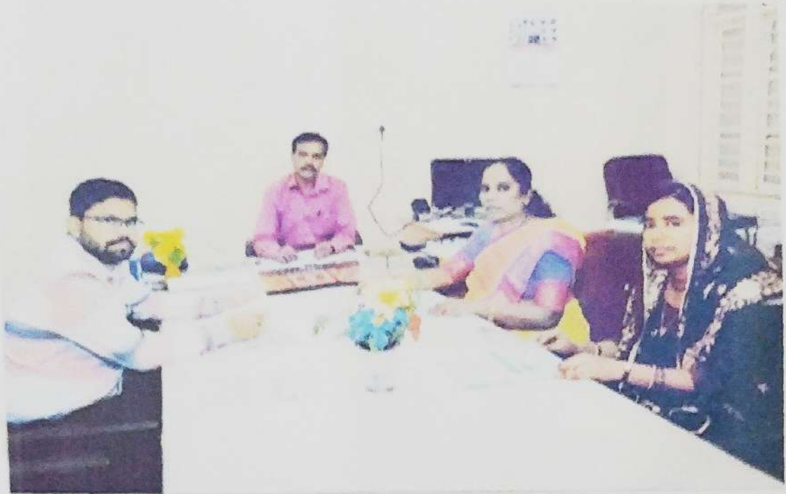
BOS Meeting BCC 2021-22