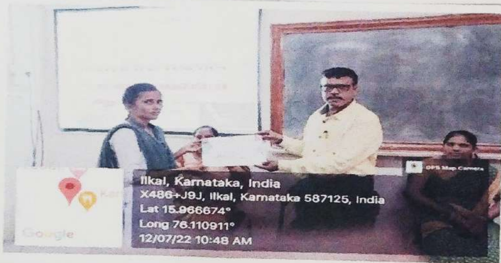
Certificate course Examination

Ilkal, Karnataka, India X486+J9J, Ilkal, Karnataka 587125, India Lat 15.966674° Long 76.110911° 12/07/22 10:48 AM