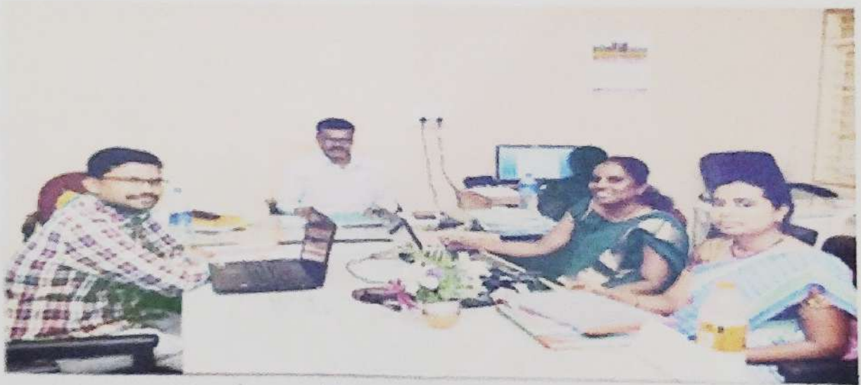
BOE Meeting BCC 2021-22