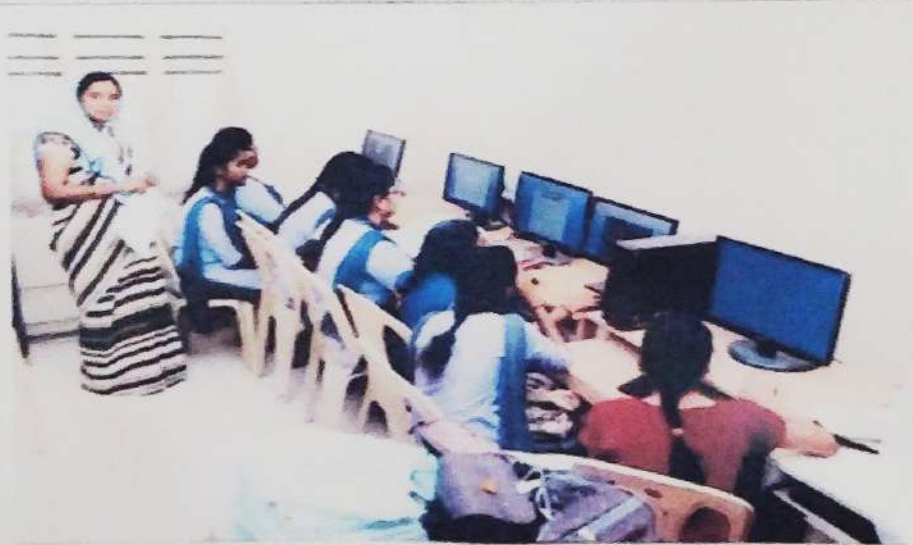
Tutor class 2021-22