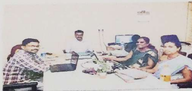
BOE Meeting Dec 2021-22