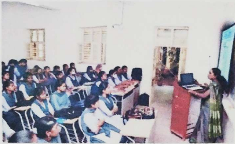
Theory class 2021-22