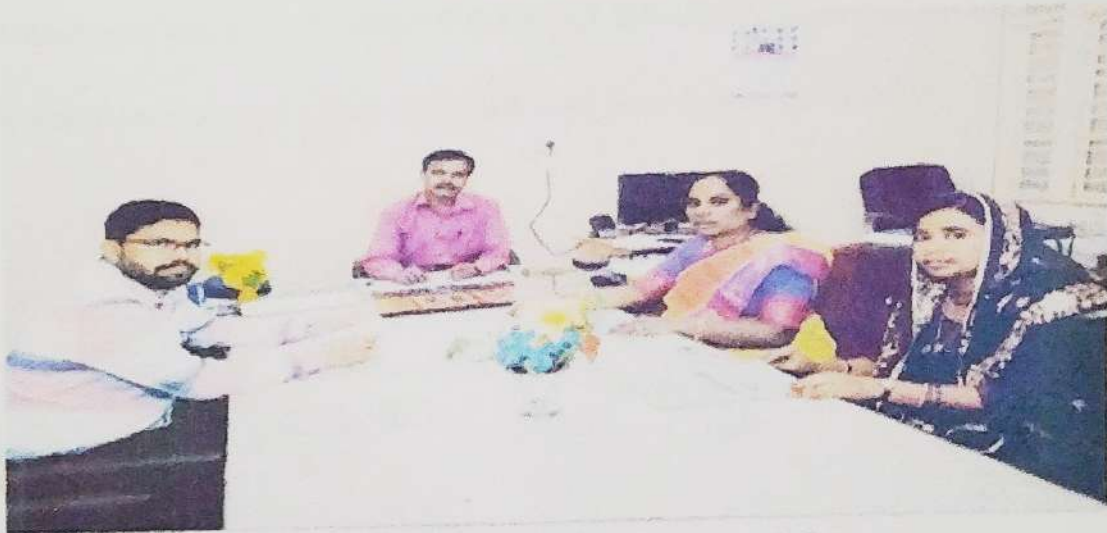
BOS Meeting BCC 2021-22

This meeting was conducted in the presence of Principal and BOS members. In the meeting, for the benefit of the students discussed to start a "C Programming Basics" Course and regarding the Syllabus. It was decided in the meeting according to the requirement. The syllabus has to frame as per the norms & course started on 01/12/2021.